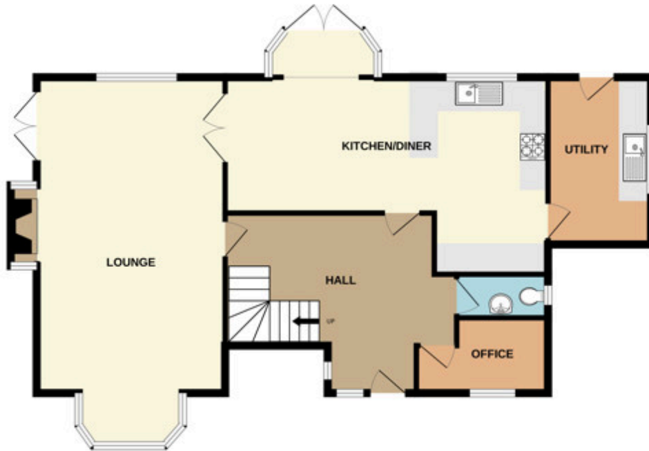
GROUND FLOOR 968 sq.ft. (89.9 sq.m.) approx.