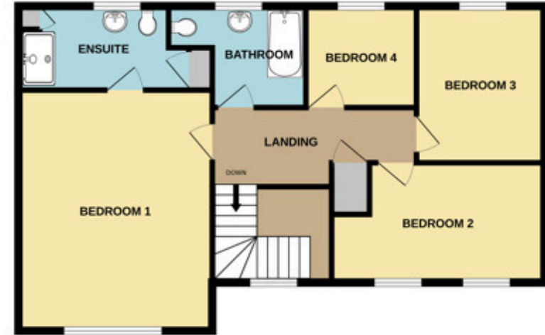
1ST FLOOR 767 sq.ft. (71.2 sq.m.) approx.