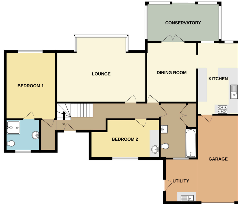
GROUND FLOOR 1448 sq.ft. (134.5 sq.m.) approx.