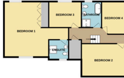
1ST FLOOR 916 sq ft. (85.1 sq.m.) approx.