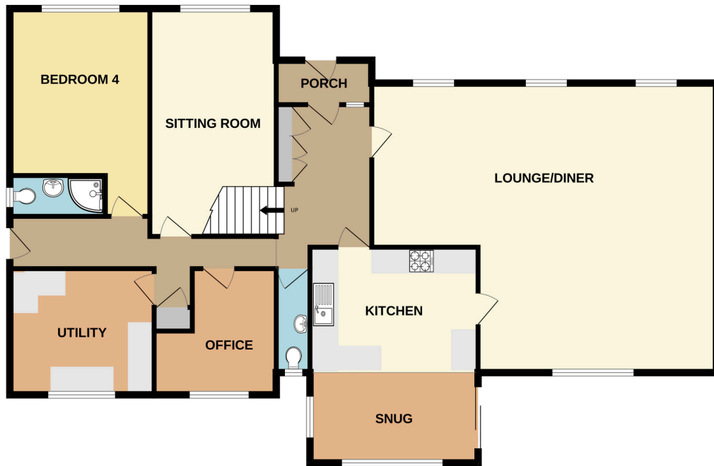
GROUND FLOOR 1601 sq.ft. (148.7 sq.m.) approx.